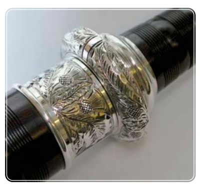
Naill Thistle engraving