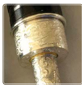
Lewis Sterling Silver Victorian engraved slide and ferrule