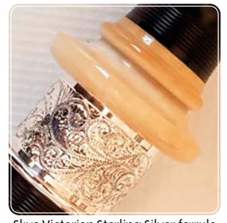
Skye Victorian Sterling Silver ferrule