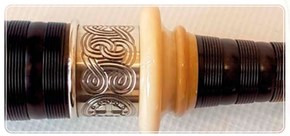
Benbecula nickel Celtic ferrule