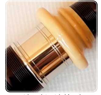
Eriskay plain nickel ferrule