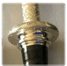
Lewis Sterling Silver Victorian engraved projecting mount and slide