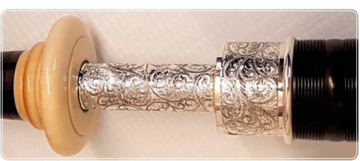
Skye Victorian Sterling Silver slide and ferrule with aged imitation ivory projecting mounts