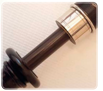
Scalpay Blackwood slide