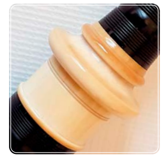
Aged imitation ivory projecting mount