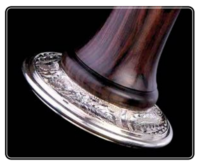
Sterling Silver Sole Hand Engraved in Runic/ Thistle/Dragon/Acanthus/Victorian or Reposse