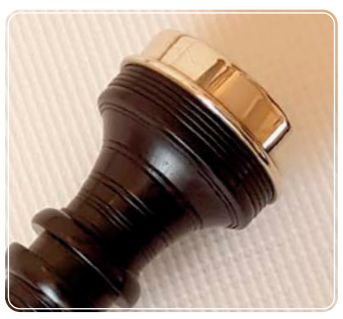
Raasay plain nickel ringcap