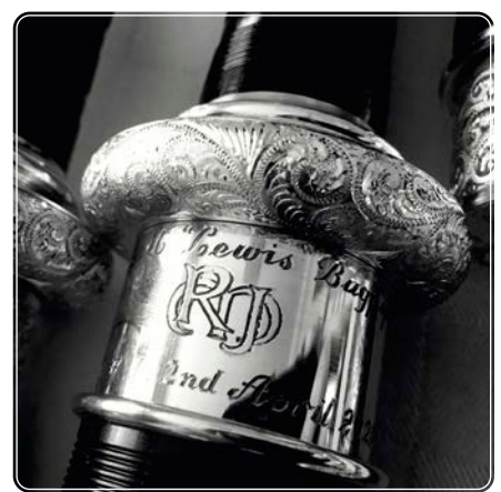
Lewis Sterling Silver projecting mount and ferrule with Victorian and RJM engraving