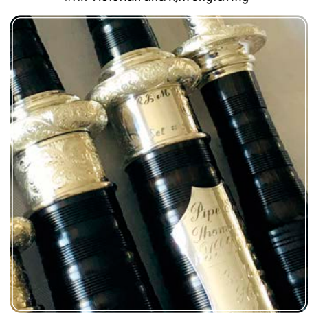
Lewis Sterling Silver projecting mounts with personalised Sterling Silver shield

The "Lewis" is the premiere set. It is truly a magnificent set of pipes, showcasing the best craftsmanship and metalwork on offer. These are the top of the line RJM pipes, fully mounted with hand engraved Sterling Silver.