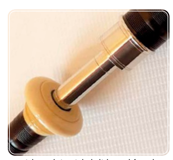
Eriskay plain nickel slide and ferrule