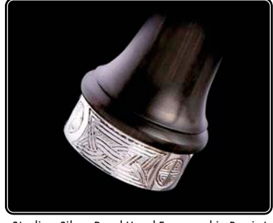
Sterling Silver Band Hand Engraved in Runic/ Thistle/ Dragon/Acanthus/Victorian or Reposse