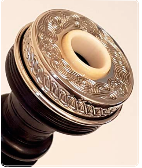
Benbecula nickel Celtic ringcap