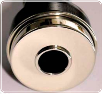
Eriskay plain nickel ringcap