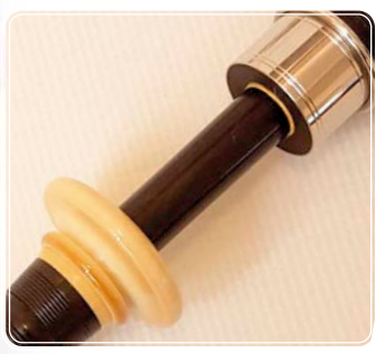
Raasay Blackwood slide