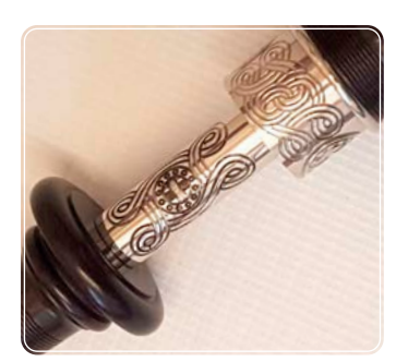
Optional Scalpay with engraved slide