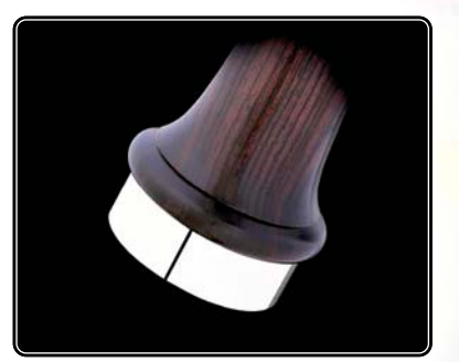
Plain Sterling Silver Band / Nickel Band

Customers can arrange to have their own pipe chanter soles fitted. Please email contact@roddymacleodbagpipes.com to arrange for this