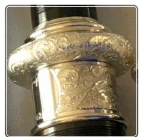
Lewis Sterling Silver Victorian engraved projecting mount and ferrule