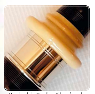
Harris plain Sterling Silver ferrule