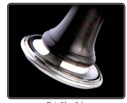
Plain Silver Sole