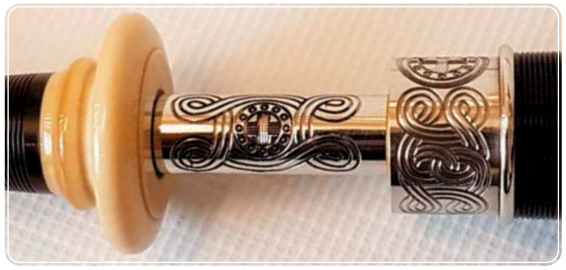
Benbecula nickel Celtic slide and ferrule