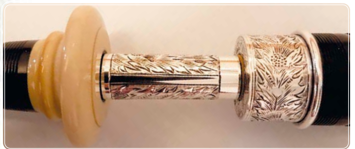
Skye Thistle Sterling Silver slide and ferrule with aged imitation ivory projecting mounts