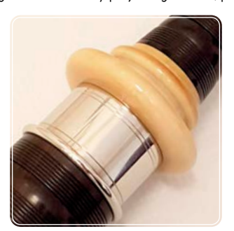
Raasay plain nickel ferrule