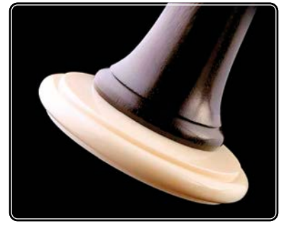
Imitation Ivory Sole