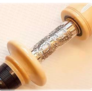
Uist Sterling Silver Thistle slide